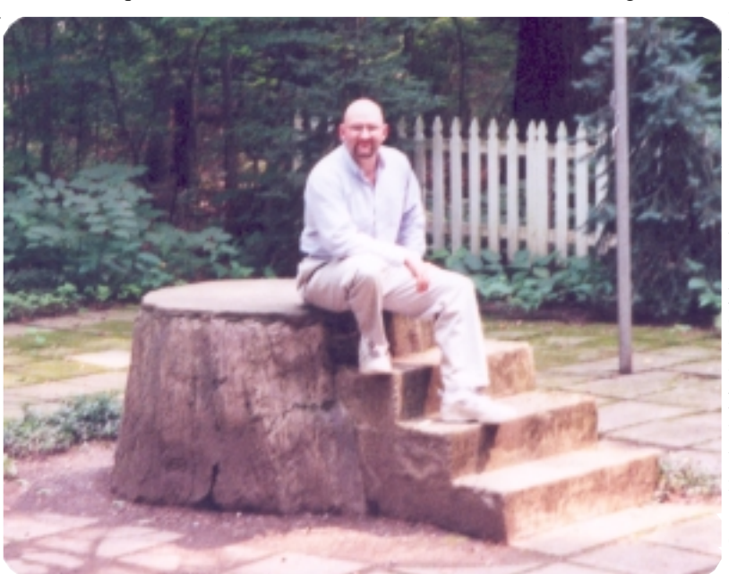
The author atop Inspiration Stump, the site of spiritualist readings.

More than 20,000 people visit Lily Dale each year; some come for the lectures, others for spiritual guidance, and still others for contact with dead loved ones. Guest mediums join the dozen or so permanent resident clairvoyants to offer free daily "message services" to the visitors at a place called Inspiration Stump. The Stump can be found in a clearing a short dis-